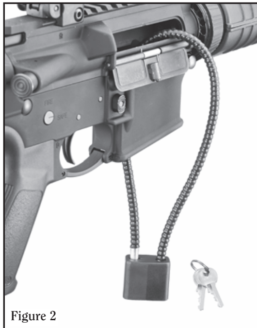
Figure 2 Correct Installation of Lock For RUGER® AR-556® Rifles