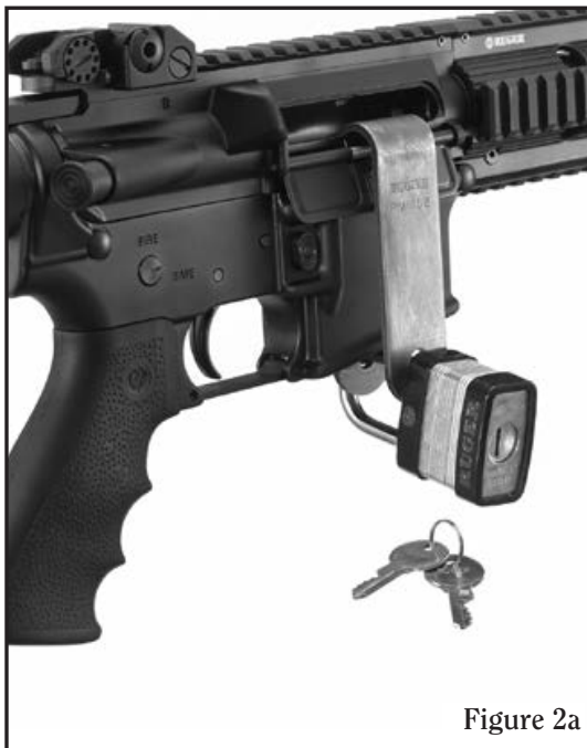
Correct Installation of Lock For RUGER® SR-556® Rifles