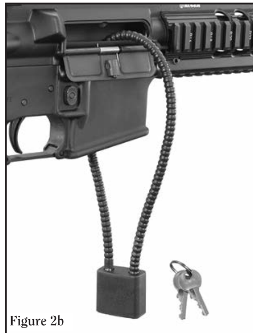
Figure 2b Correct Installation of Cable Lock For SR-762™ Rifle