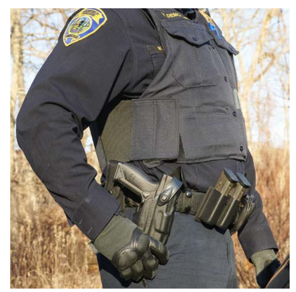
Law enforcement routinely wear gloves, which are incompatible with certain UAF technologies.

As the foregoing illustrates, blanket assertions about the viability of unproven "smart gun" technologies ignore real and daunting challenges. UAF advocates also routinely minimize the efficacy of a variety of widely available (and historically effective) devices which can be used to secure or disable firearms.<sup>47</sup>