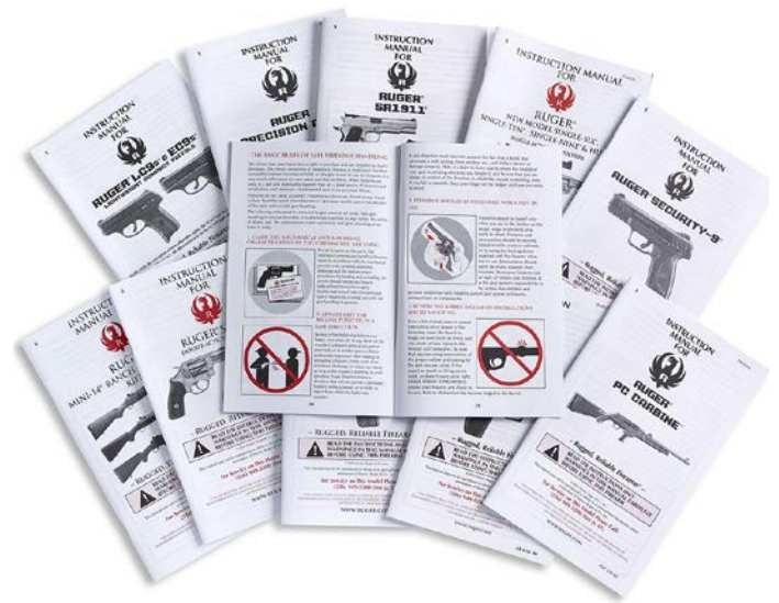
Ruger instruction manuals are included with each new firearm and are available for free download on our website.

Many firearms, while similar in appearance, operate in very different ways and some firearms are more complicated than others. Accordingly, one of the most basic rules of gun handling safety is to understand the operational characteristics of a firearm before attempting to use it. As a reminder to consumers of this important rule, over 40 years ago Ruger began the practice of marking a message directly on the firearm to remind consumers to read the instruction manual before using the firearm. Notably, this practice has been emulated by many other manufacturers over the years.