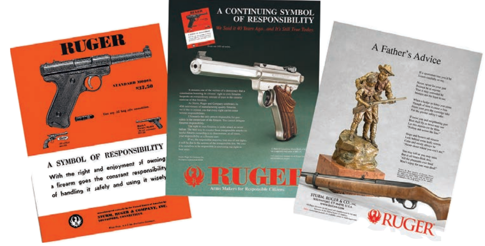
These are a few samples of Ruger safety ads.

In 1955, only a few years after the Company began operations in a small barn in Southport, Connecticut, Ruger pioneered the practice of running full-page safety messages in the most popular firearms magazines. Our first such message reminded consumers that, "with the right of owning a firearm goes the constant responsibility of handling it safely and using it wisely." In the more than six decades that have elapsed since then, Ruger has continued this practice with the famous A Father's Advice , The Empty Chamber , and other notable safety messages.<sup>1</sup>