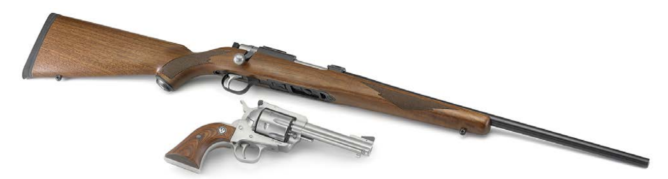
The Ruger 77/17® bolt-action rifle and New Model Blackhawk® revolver are just a few examples of the nearly 400 SKUs Ruger offers.

to enjoy broad appeal among users with varying levels of confidence and expertise, in a wide range of shooting disciplines. Ruger currently offers nearly 400 catalog SKUs across a variety of product lines.