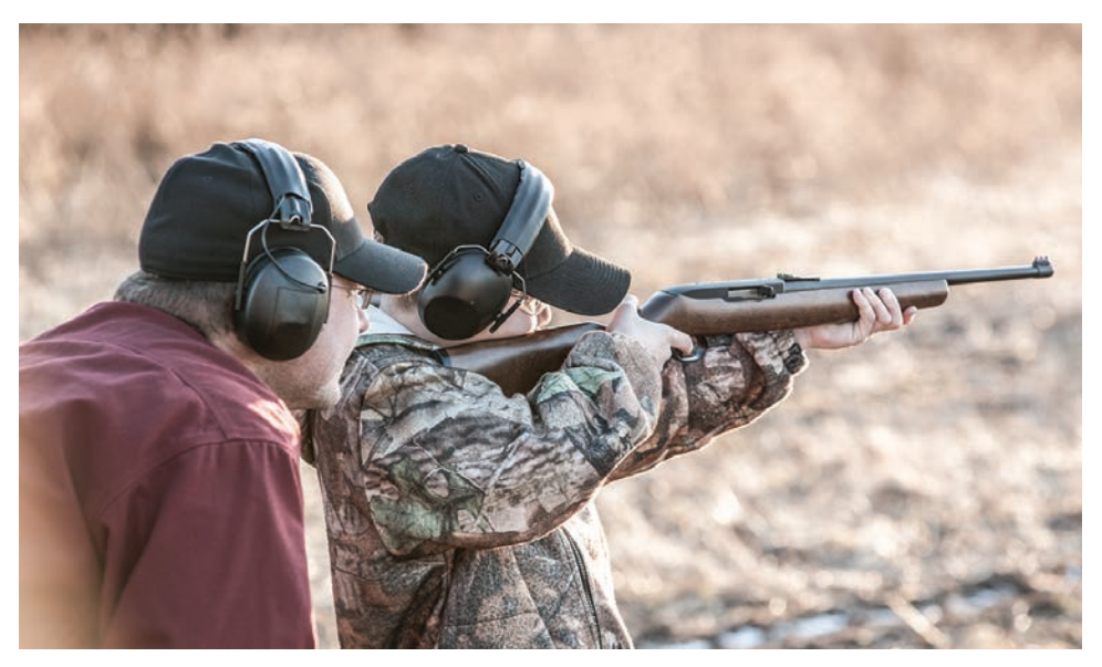
Ruger's substantial contributions via the Pittman-Robertson excise tax help fund hunter education programs.

This excise tax provides millions of dollars annually for hunter safety. In its FY 2013 Budget Justification, the U.S. Fish and Wildlife Service reported that approximately $66.5 million was available to assist states in providing hunter education, shooting and archery ranges, and young hunter programs.<sup>28</sup> In 2011, over one million students completed hunter education programs funded by the Pittman-Robertson excise tax. The report also explains that "[s]tates' hunter education programs have trained more than ten million students in hunter safety and had over 3.6 million students participating in live-fire exercises over a span of 42 years. This effort has resulted in a significant decline in hunting-related accidents and has increased the awareness of outdoor enthusiasts on the importance of individual stewardship and conserving America's resources."29 (Emphasis added.)