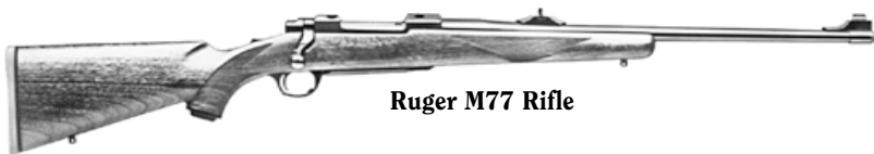
Ruger M77 Rifle

Sturm, Ruger manufactured M77 bolt action rifles from 1968 to 1991. The trigger overtravel adjustment set screw (shown on right) in a few of these rifles may not be securely tightened and may move too readily. This change in original adjustment can, in extreme cases, either cause the rifle to fire unexpectedly (with the safety "off) or cause the rifle to not fire at all. This may occur suddenly and without warning.